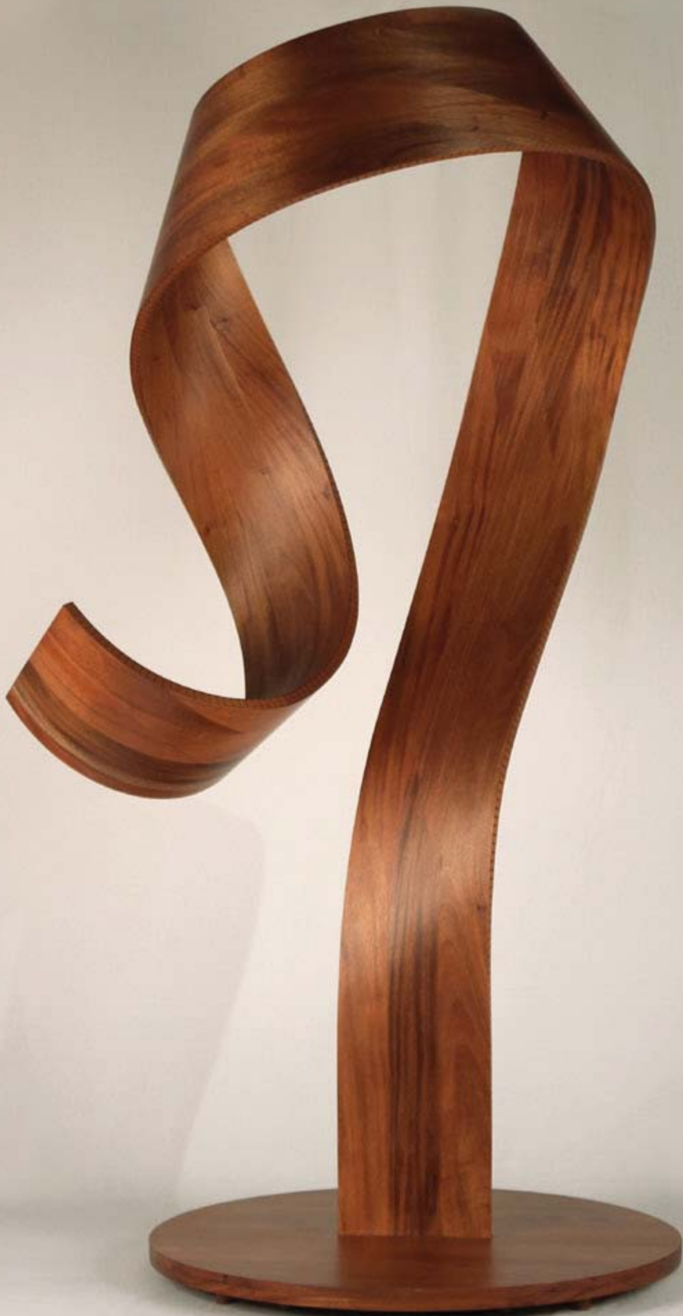
Paul Vexler, Cobra , 2015, Mahogany, P-Lam backer, 116 X 62 X 48 inches