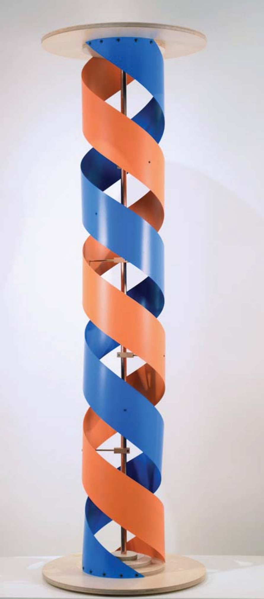
Paul Vexler, Helix , 2015, p-lam backer, copper, brass, wood, acrylic paint, 78 X 24 X 24 inches