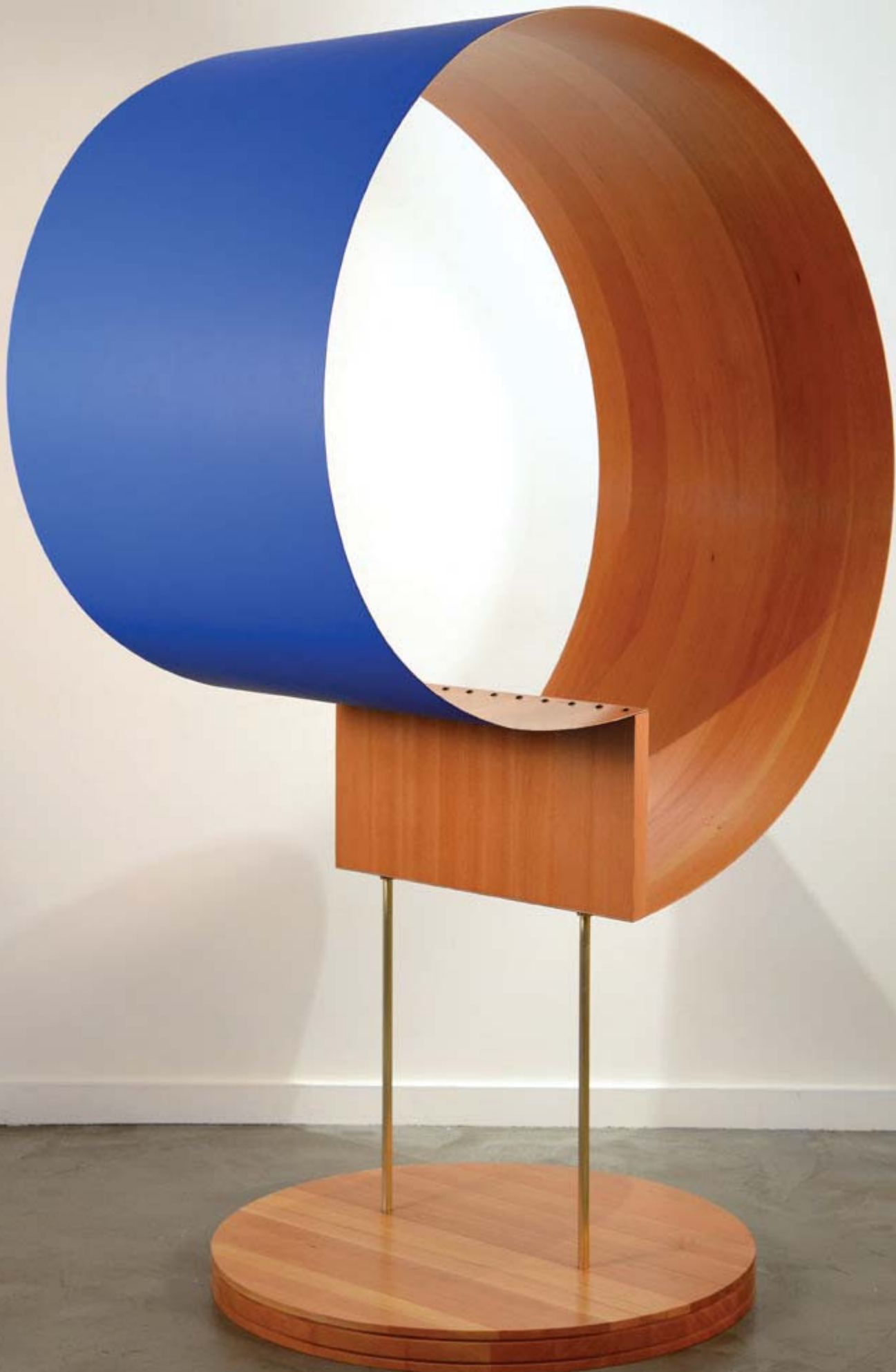
Paul Vexler, Blue Step , 2015, vertical grain fir, p-lam backer, brass, acrylic paint, 73 X 50 X 29 inches