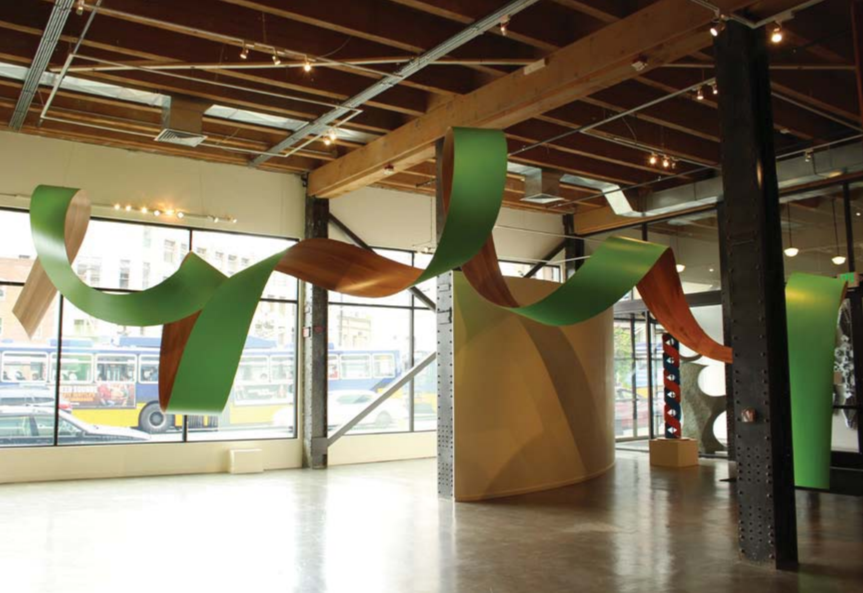
Paul Vexler, Twisted , 2015, wood, p-lam backer, 168 X 408 X 142 inches (variable)