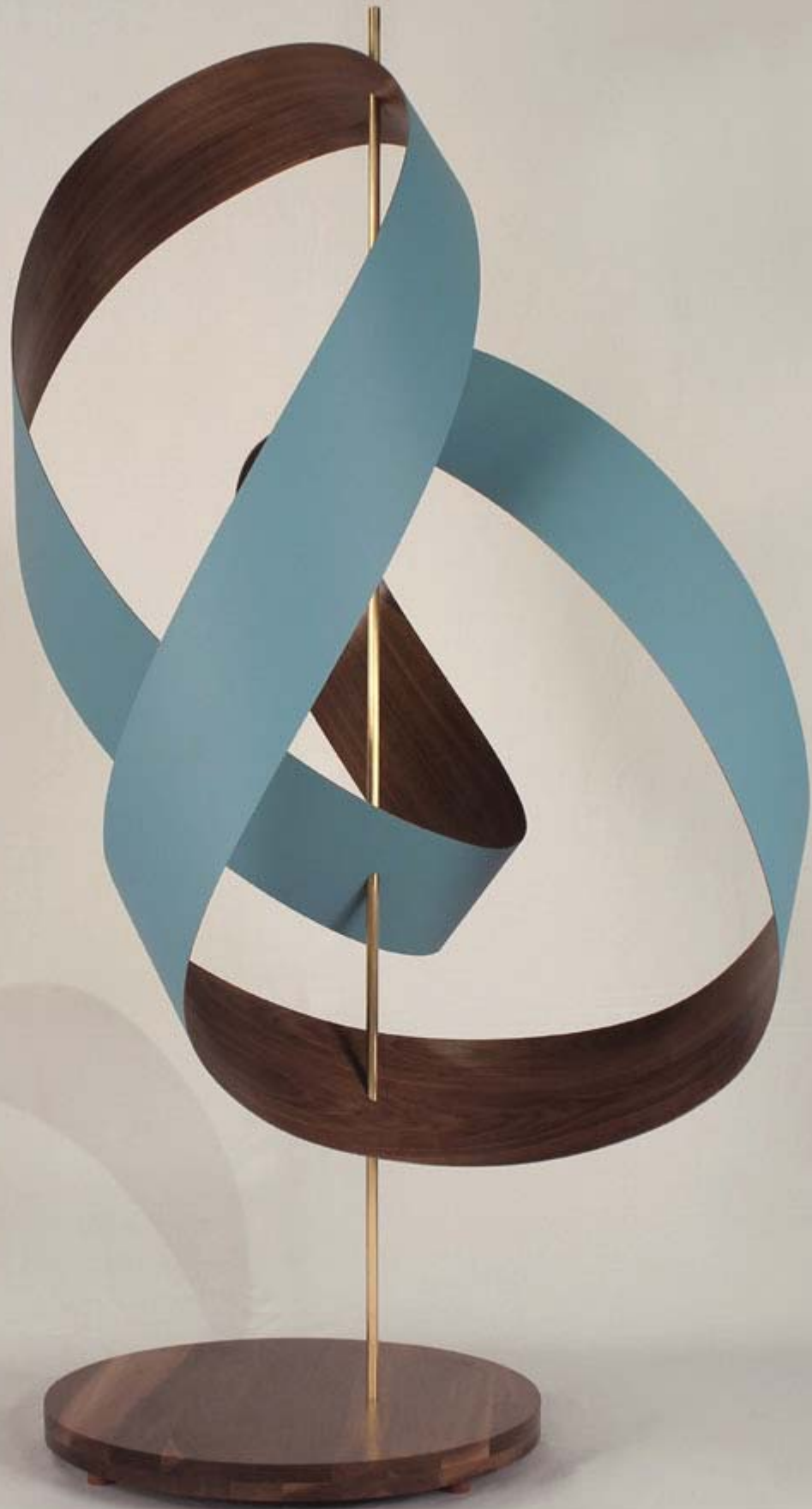
Paul Vexler, Blue Loops , 2015, walnut, P-lam backer, brass, 77 X 42 X 42 inches