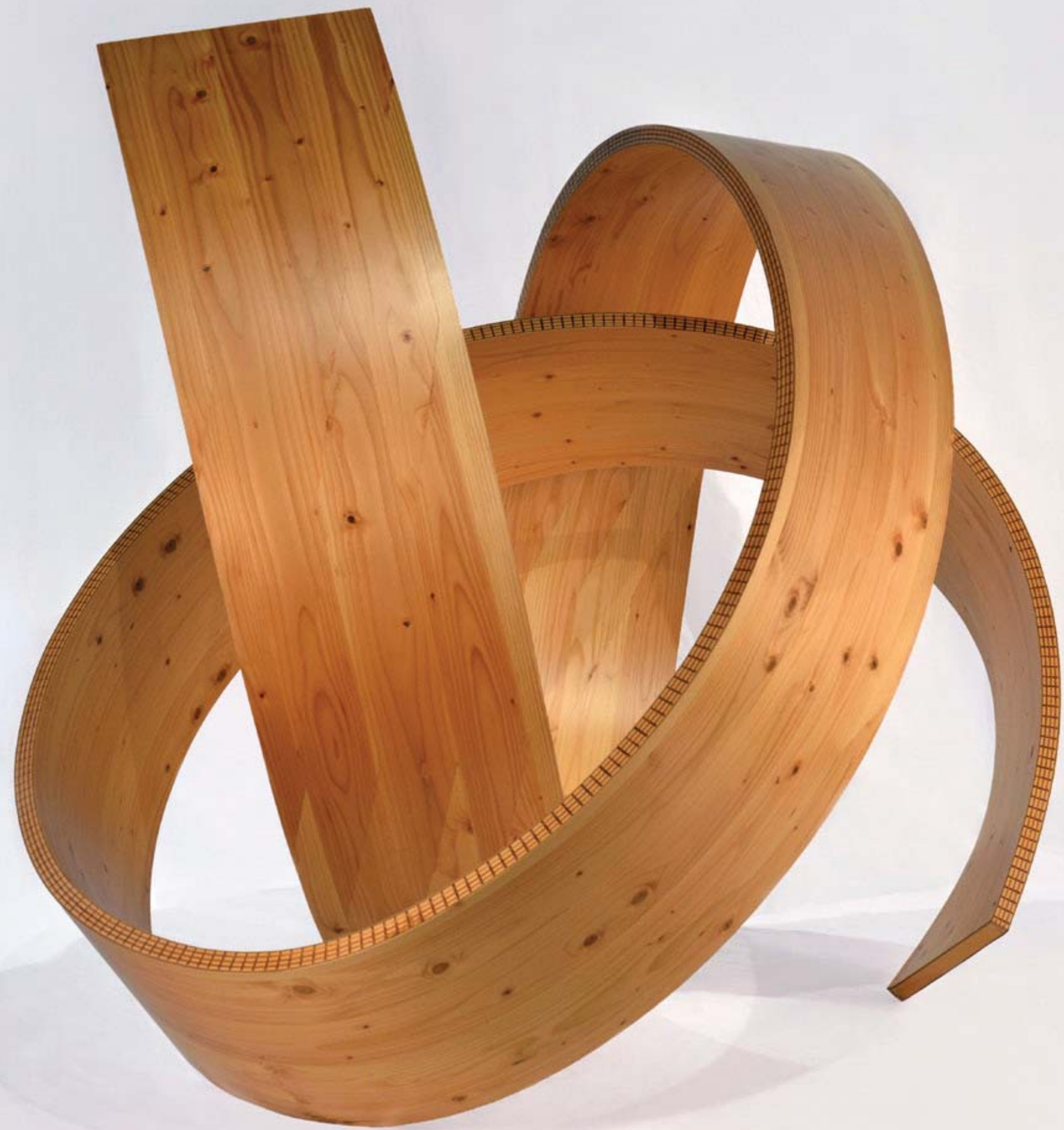
Paul Vexler, Metropolitan , 2015, douglas fir, Plyam backer, 65 X 80 X 72 inches