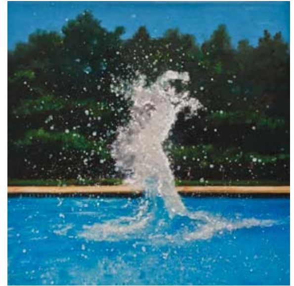
Eric Zener, Ready, Set, Go! I (Series 2) , mixed media, 13.5 X 13.5 inches Eric Zener, Ready, Set, Go! II (Series 2) , mixed media, 13.5 X 13.5 inches Eric Zener, Ready, Set, Go! III (Series 2) , mixed media, 13.5 X 13.5 inches Eric Zener, Ready, Set, Go! IV (Series 2) mixed media, 13.5 X 13.5 inches