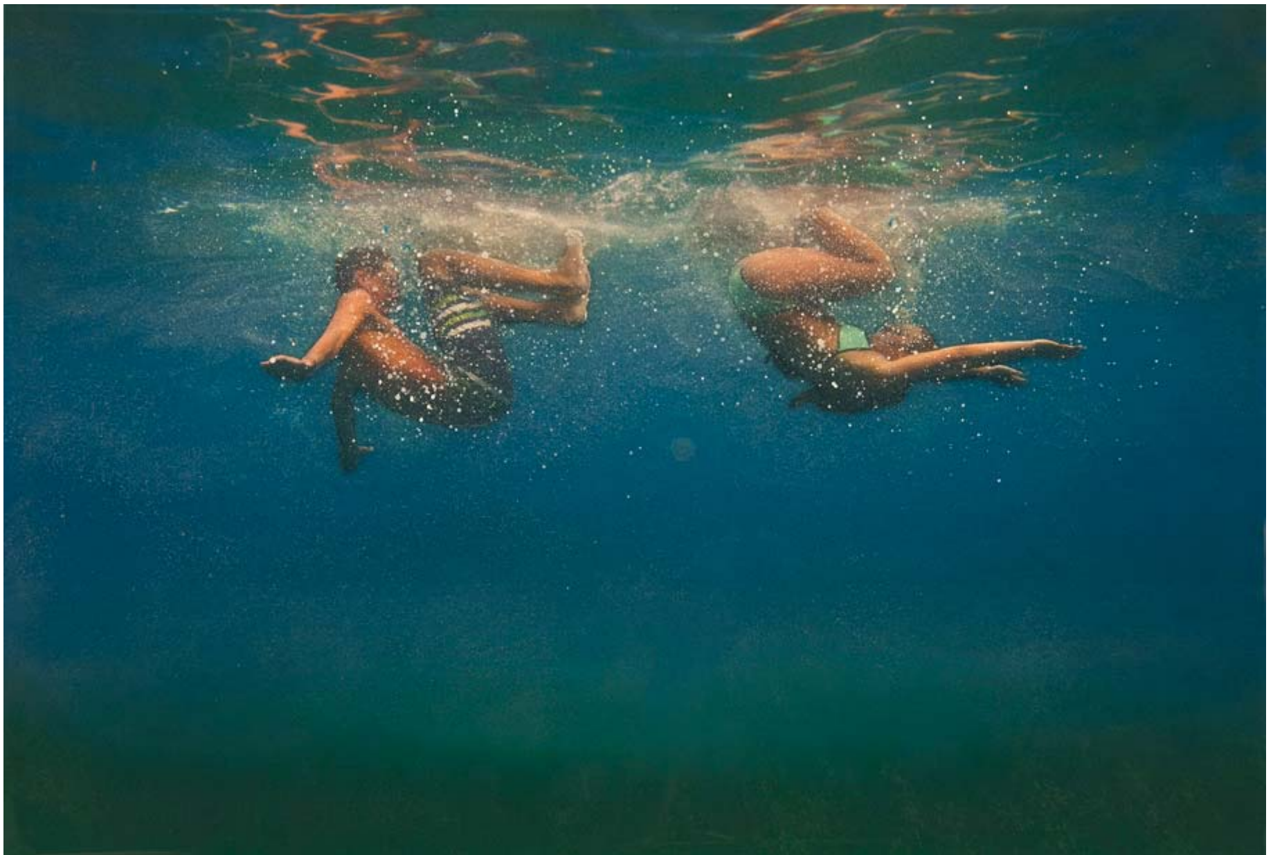
Eric Zener, Summer Tumble , oil on canvas, 30.5 X 41 inches