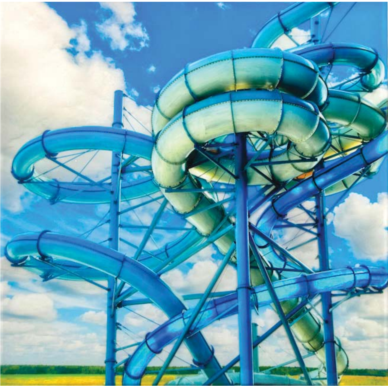
Eric Zener, Twist and Turn 3 , mixed media, 41 X 41 inches