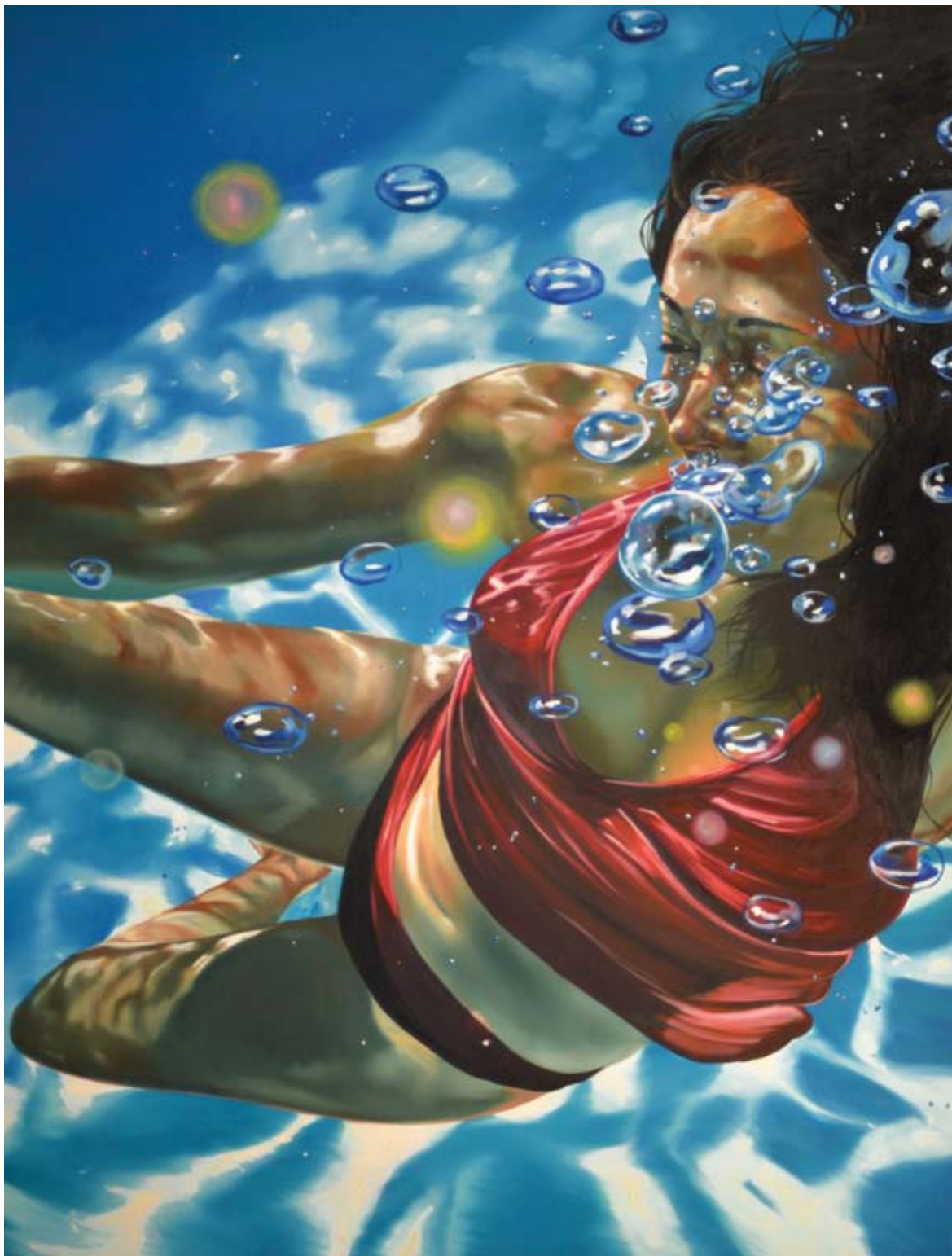
Eric Zener, Unbound , oil on canvas, 88 X 66 inches