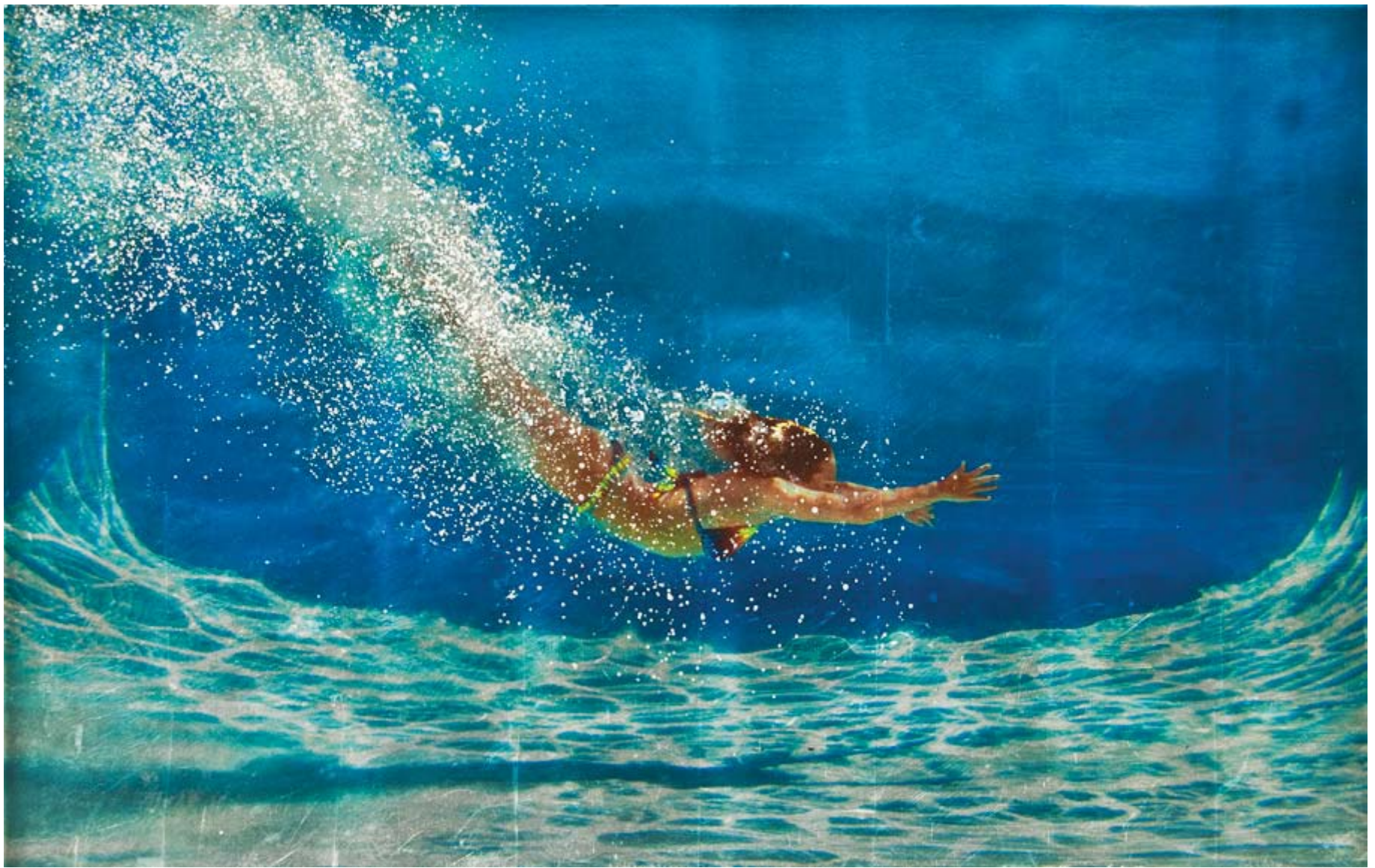
Eric Zener, A New Direction , mixed media, 26 X 41 inches