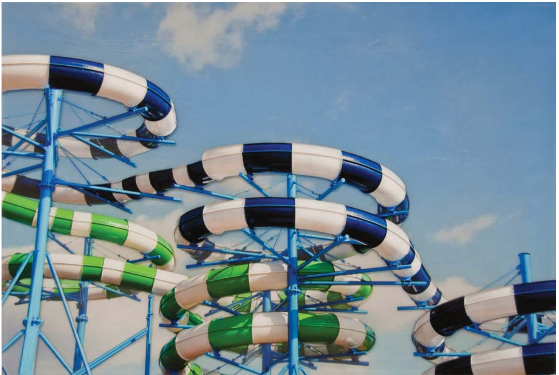
Eric Zener, Twist and Turn 2 , mixed media, 28 X 41 inches