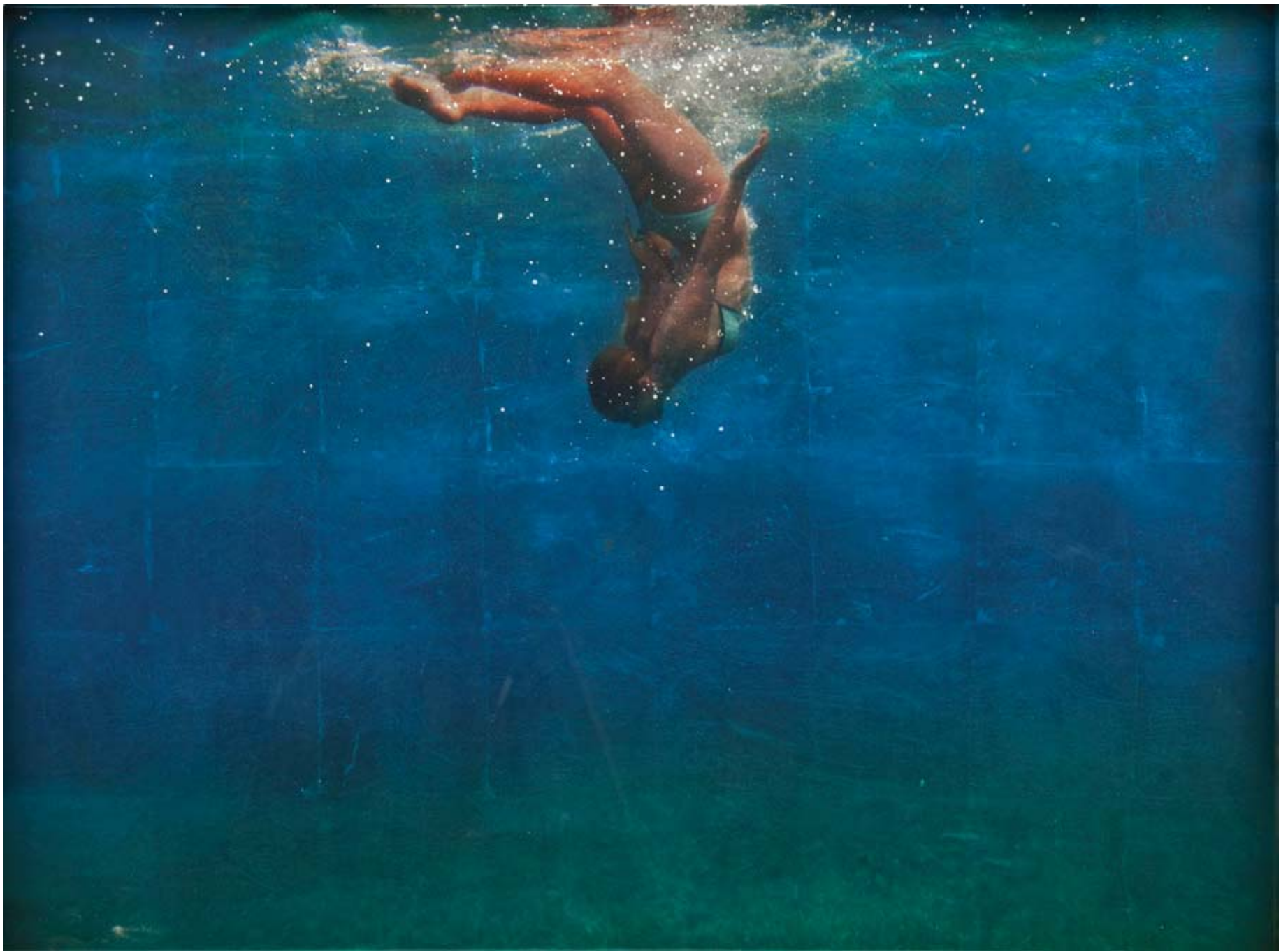
Eric Zener, U Turn , mixed media, 30 X 41 inches