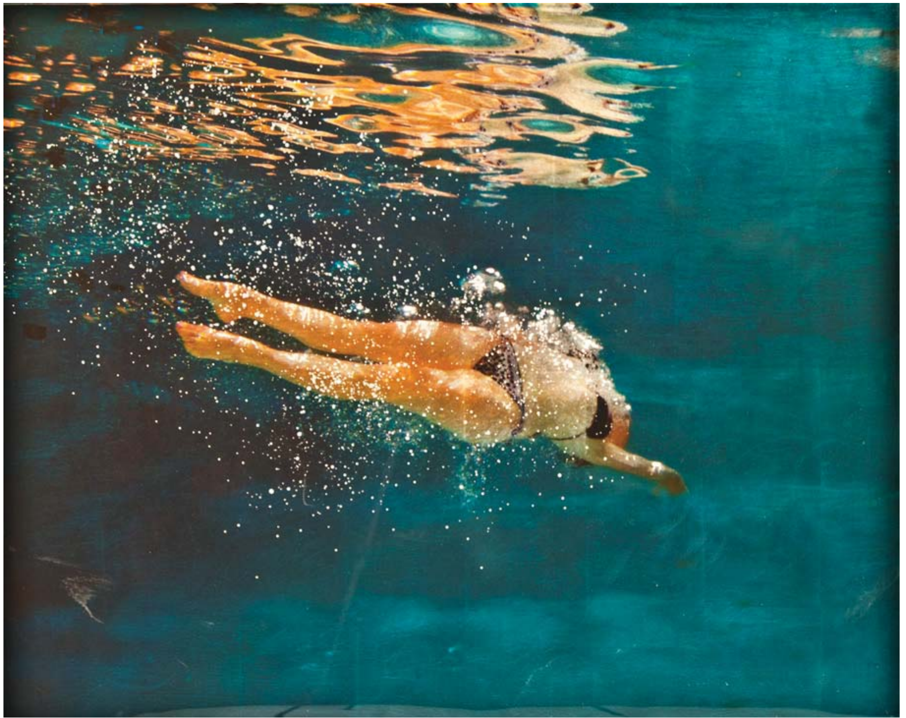
Eric Zener, Mirror , mixed media, 33 X 41 inches