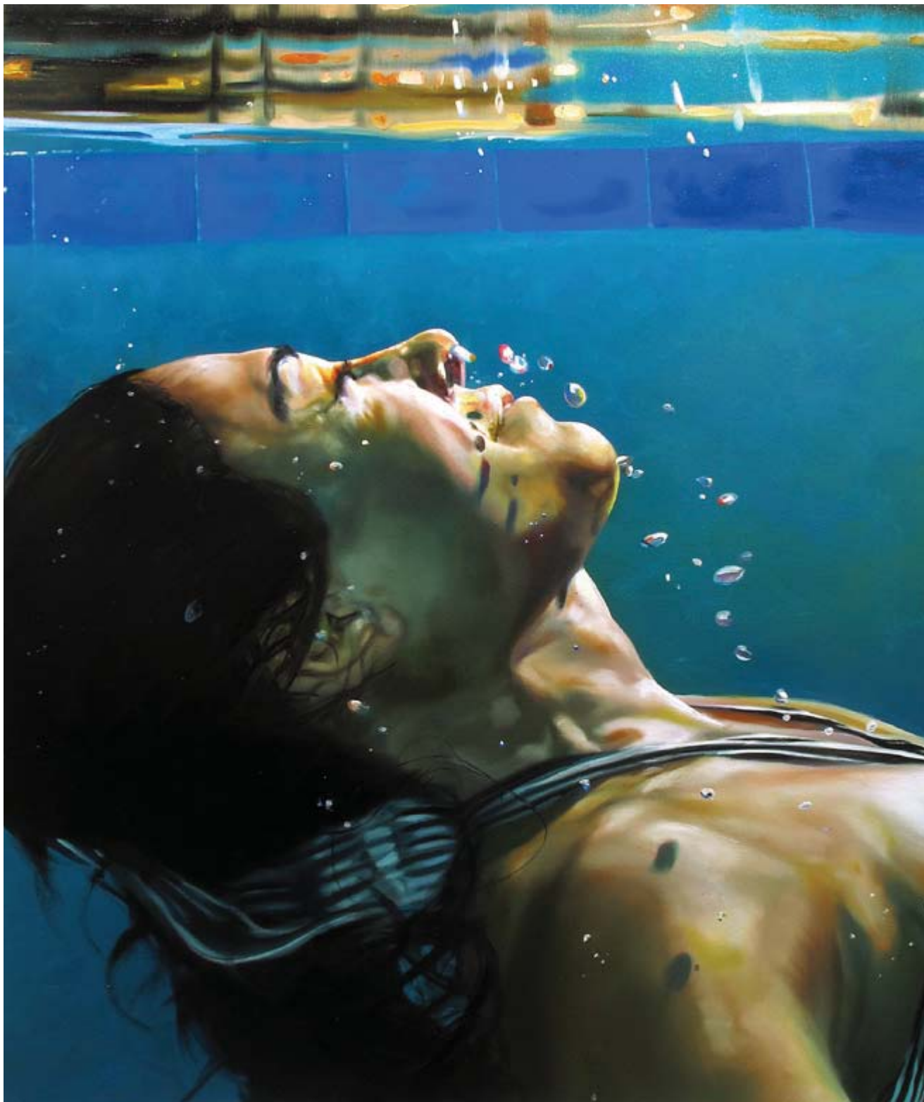
Eric Zener, The Light , oil on canvas, 48 X 38 inches